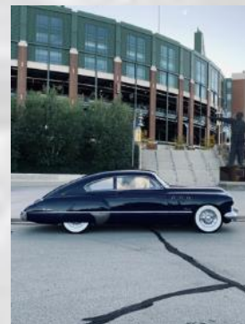
As it looks today