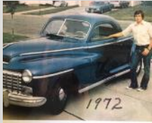
When I bought my 47 Dodge in 1972