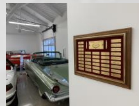
The COTB Member of the Year plaque hanging at The Automobile Gallery