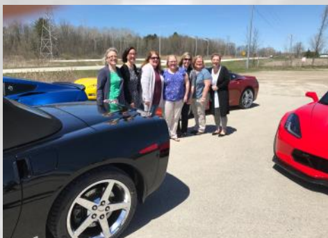
Teacher Appreciation Day—May 7 St. Anthony's School, Oconto Falls Seven teachers were honored and given rides to lunch in these beautiful COB Corvettes.

A safety video and additional safety information are available online at : www.dot.wisconsin.gov/localgov/aid/adopt-a-highway.htm